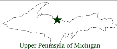
Upper Peninsula of Michigan